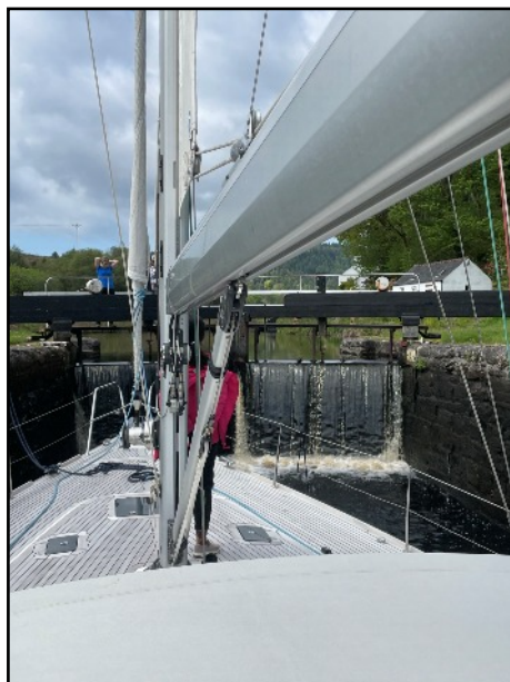
Crinoline Canal lock

currents, presented both challenges and delights. Imagine our surprise at encountering playful dolphins in waters as chilly as 13 degrees Celsius! Our first port of call was Rothesay, where we indulged in a feast of fresh langoustines and mussels, a tantalizing prelude to the gastronomic adventures that lay ahead.