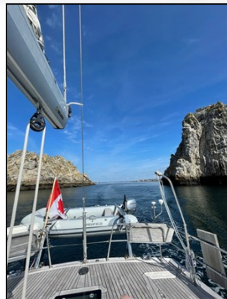
Attention to water depth were important when navigation near shore

As we ventured southward, the landscape grew increasingly