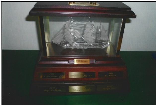
Mary Pritchard Award