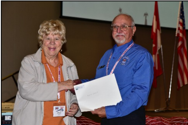
Mary Pritchard Award