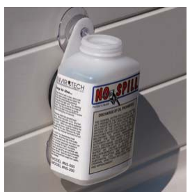
Collection container at fuel vent