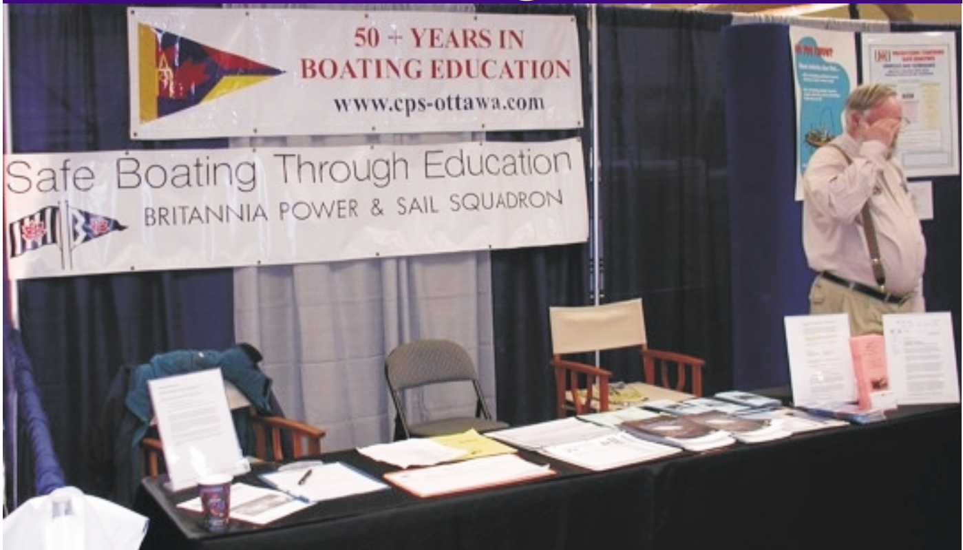
CPS booth at the recent 2006 Ottawa Boat, Sportsmen's & Cottage Show manned by Britannia and Ottawa Power and Sail Squadron members.

The Official Newsletter of the Britannia Power & Sail Squadron